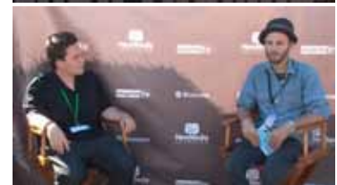
New Youth Video Content