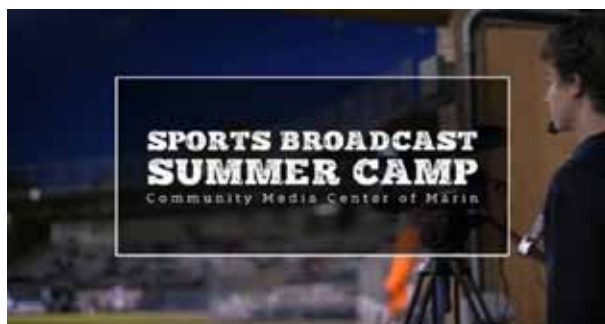
Sports Broadcast Summer Camp - Click to Watch!