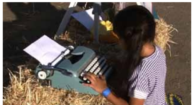
Students Viewpoints Bioneers - Click to Watch!