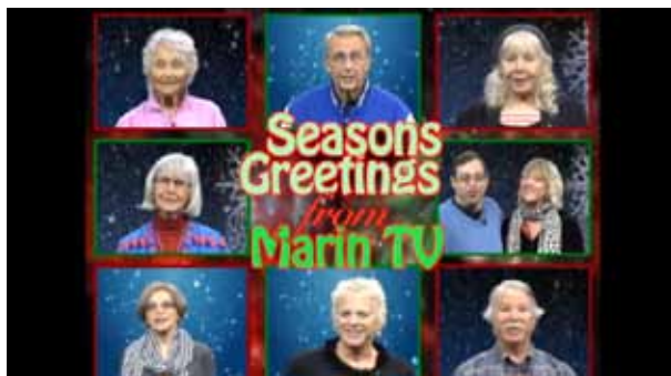
CMCM Member 2014 Holiday Greeting