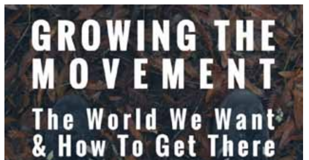
Bioneers 2014 Promo - Click to Watch!