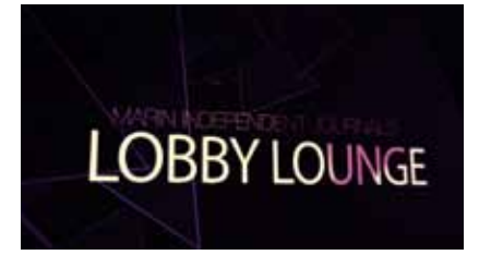
Youth Musicians Performing in the Lobby Lounge at Marin Center's Showcase Theater on April 22, 2016.