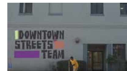
Downtown Streets Team, a Public Service Announcement/Short.