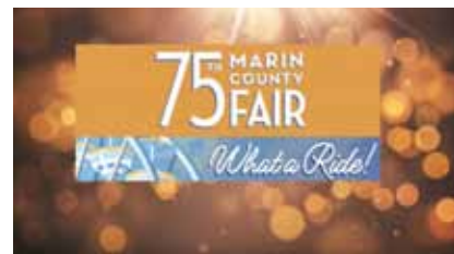
Marin County Fair 75th Anniversary Memories - memories of the fair over the years. Produced for the Marin County Fair.