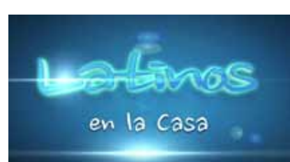
Latinos en la Casa is a community health resource show created with your health and well-being in mind. In Spanish.