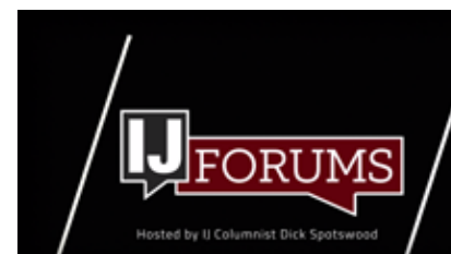
IJ Forums: Homelessness in San Rafael. One in a series of regular programs produced with the support of CMCM.