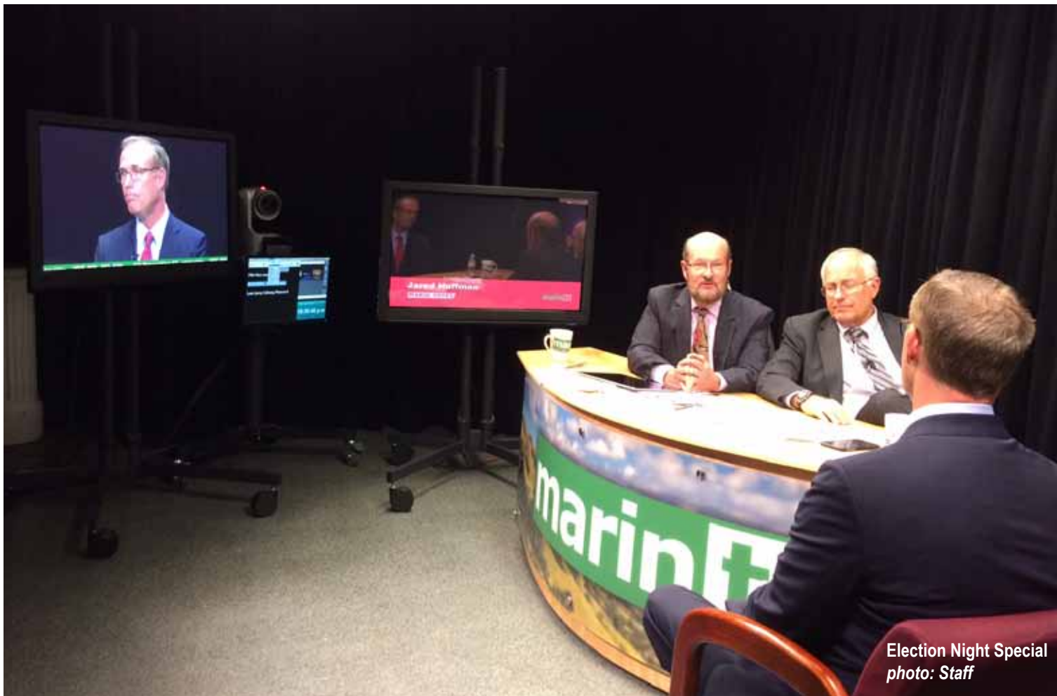
Election Night Special