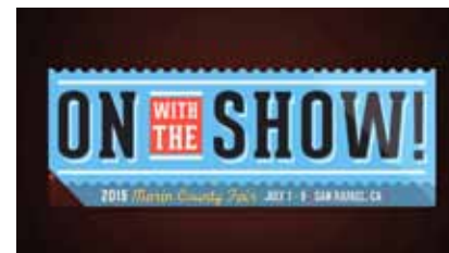
Highlights and interviews from the Marin County Fair from July 1 - 5, 2015