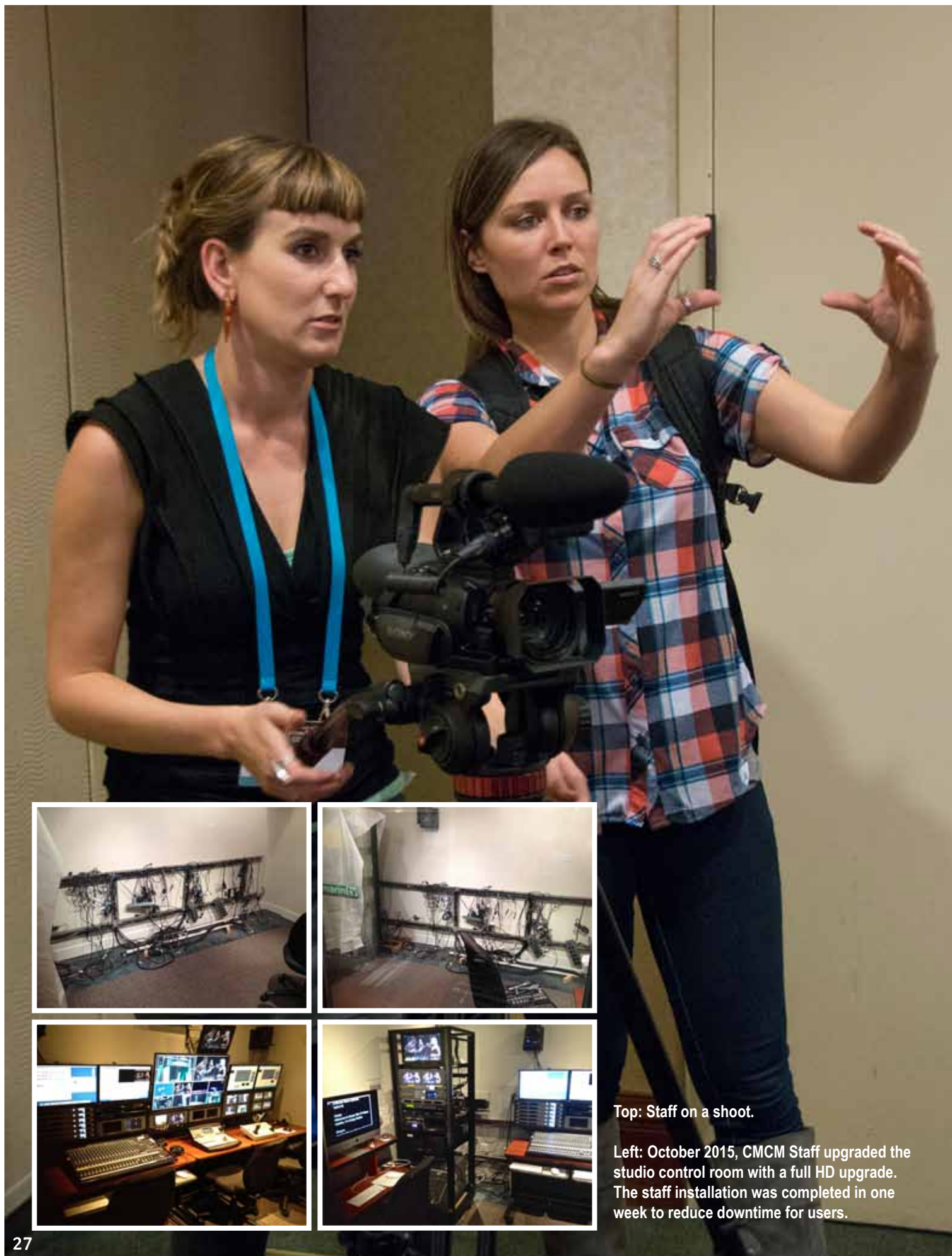
Top: Staff on a shoot.