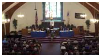
Forum on Racial Justice. A community forum held on February 28th, 2016, Marin City.