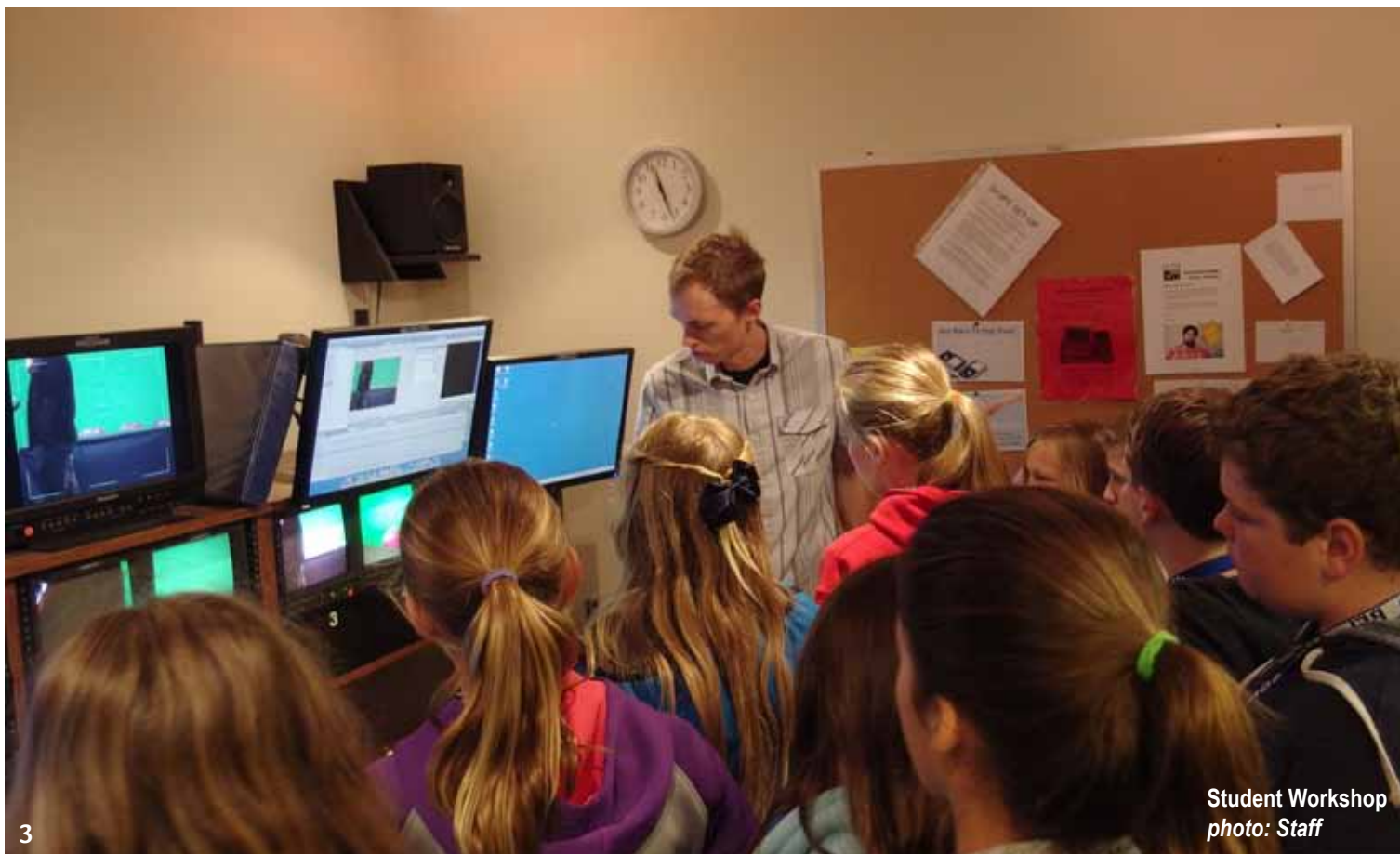
Student Workshop