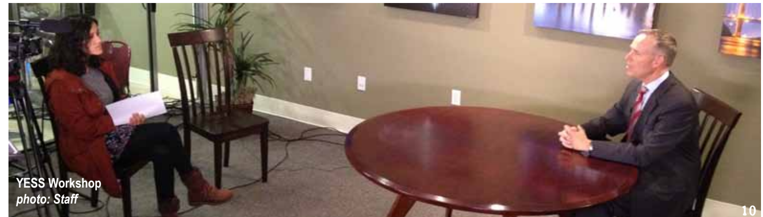
YESS Workshop