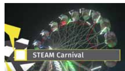
Marin County Fair: STEAM Carnival interviews and highlights from the Fair.