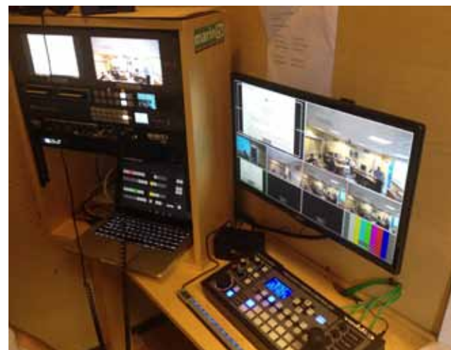
New Video Installation at the Town of Corte Madera.

*NOTE: All totals above are hard capital costs and do not include related labor costs.