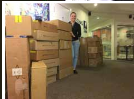
New CMCM Master Control Facility Left: The boxes before the installation