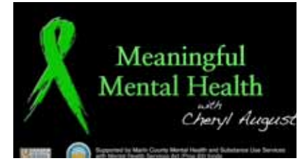
Meaningful Mental Health: Suicide Prevention. Produced with the Marin County Department of Health.