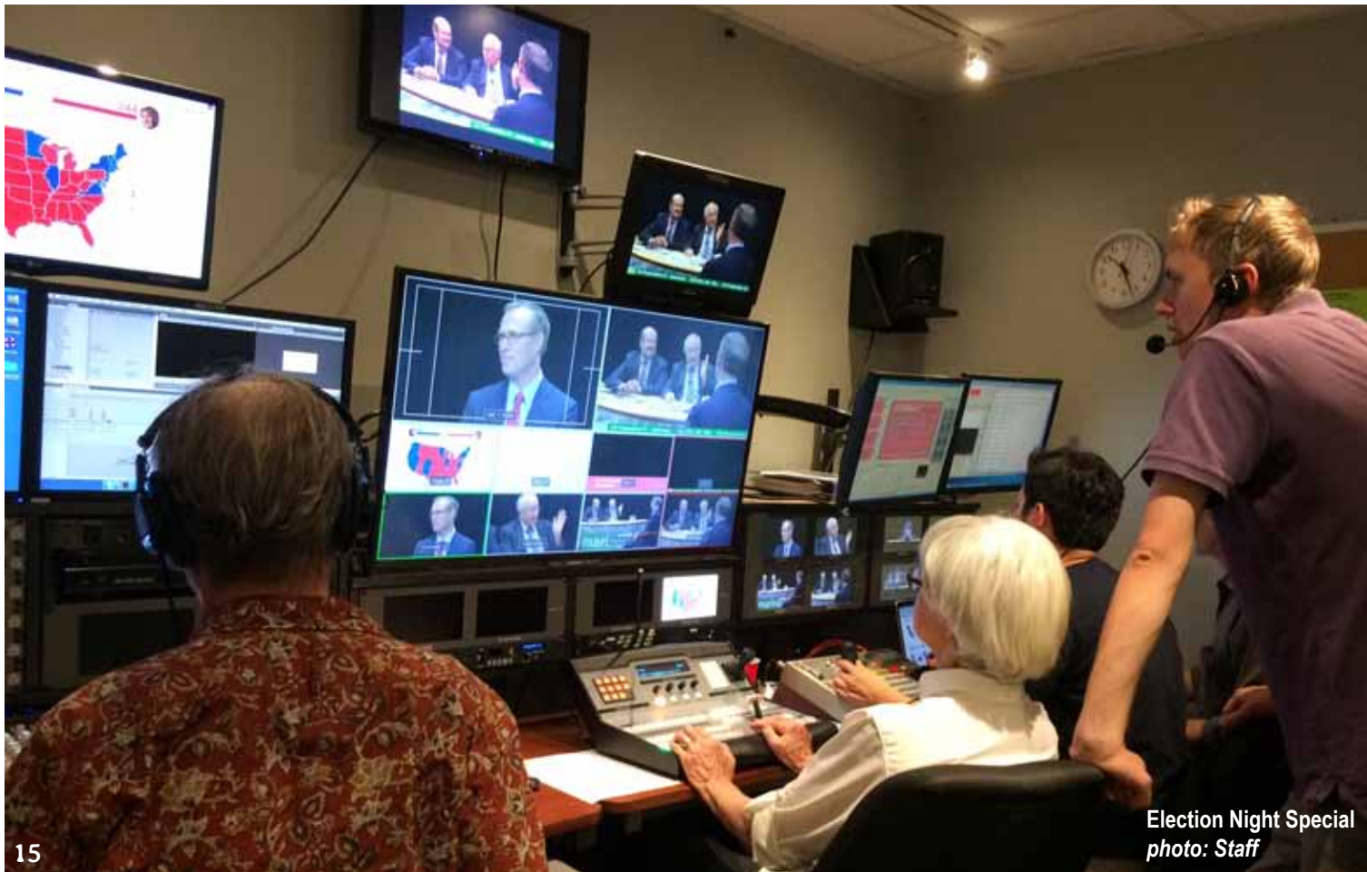
Election Night Special