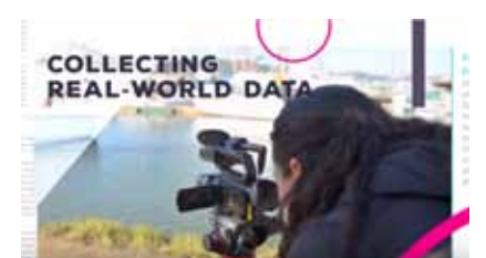
YESS, Youth Exploring Sea level rise Science. Video produced in conjunction with the County. English version.