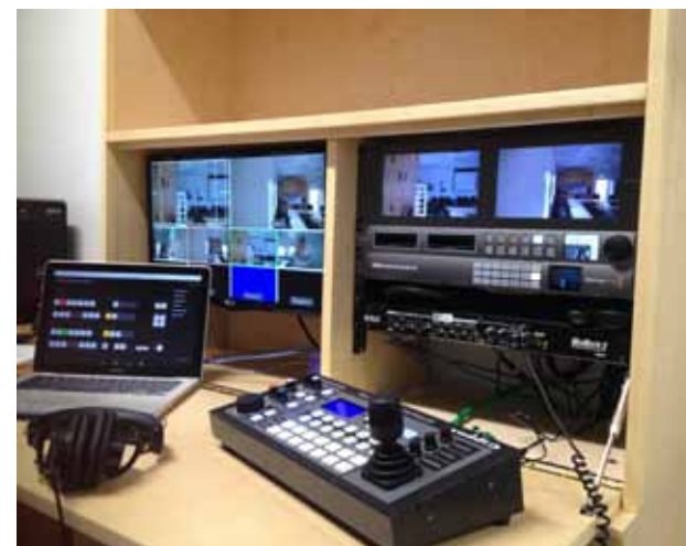
New Video Installation at Marin Clean Energy.