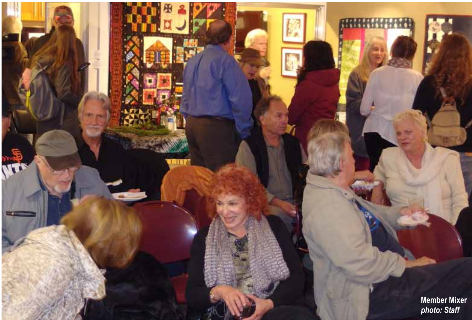
Member Mixer