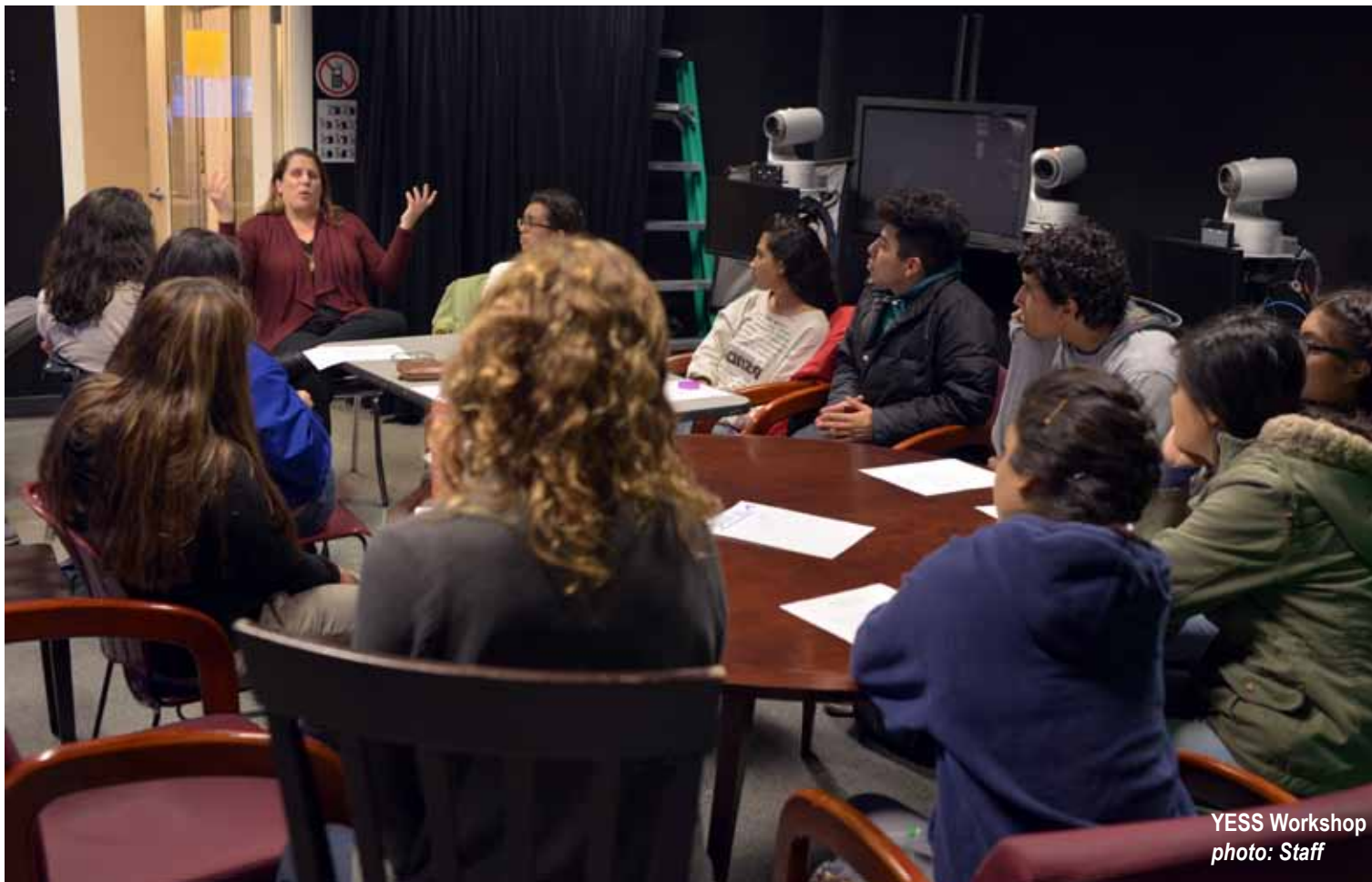
YESS Workshop