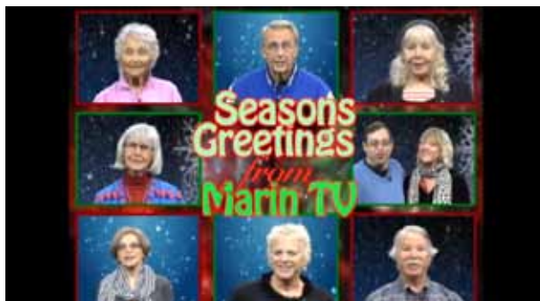
CMCM Member 2014 Holiday Greeting