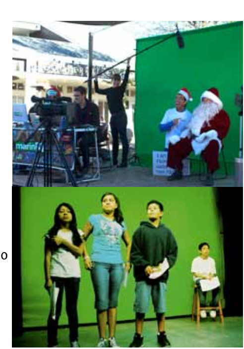
CMCM Community Work